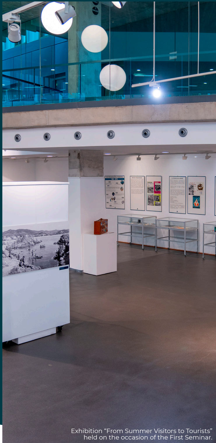
Exhibition "From Summer Visitors to Tourists" held on the occasion of the First Seminar.