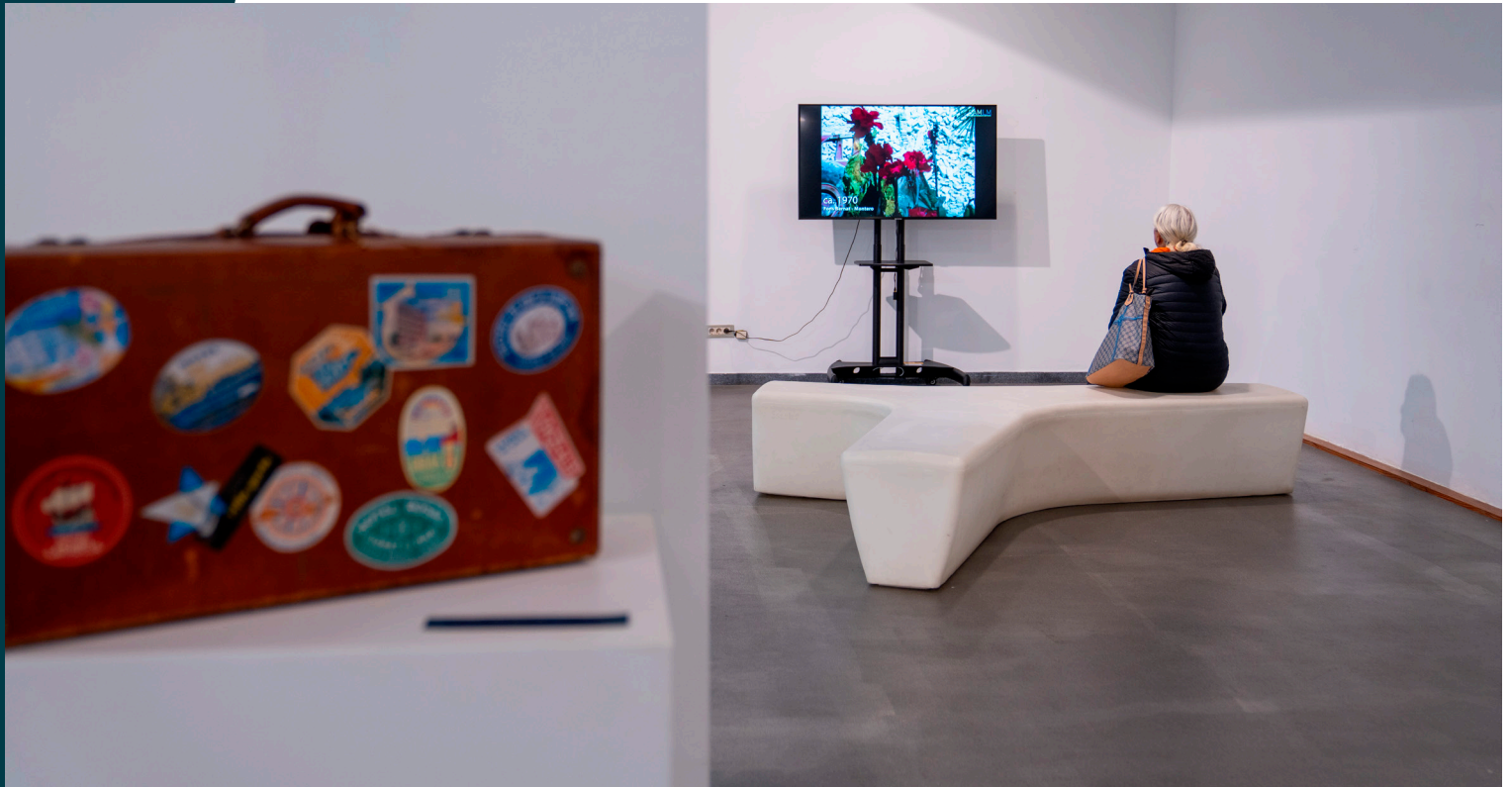
Exposició "De veranejants a turistes" celebrada amb motiu del I Seminari

CEO at the Centre for Business History in Stockholm