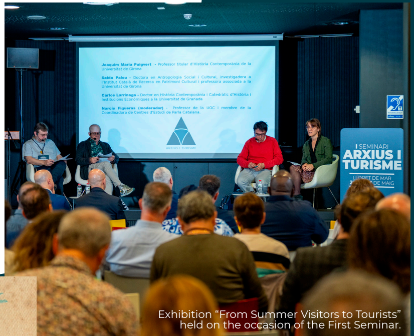
Exhibition "From Summer Visitors to Tourists" held on the occasion of the First Seminar.

This initiative seeks to advance the understanding, preservation, and valorization of this documentary heritage, which is indispensable for comprehending the transformations of contemporary society and the pivotal role of tourism in our recent historical narrative.